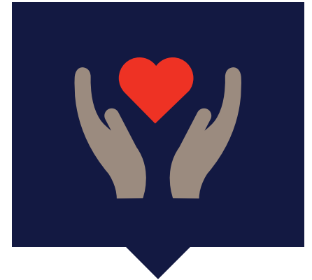
Helping Women Recover