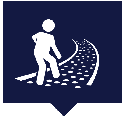
A Woman's Path to Recovery